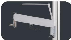
Phoropter Arm & Foldable LED Illumination Lamp