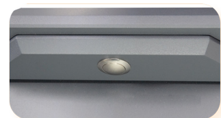
Table Top Electromagnet Lock Switch