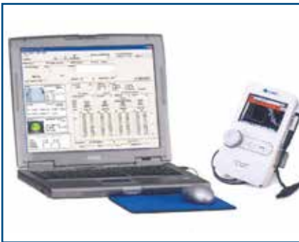
Connectable to Laptop or PC wireless or USB.