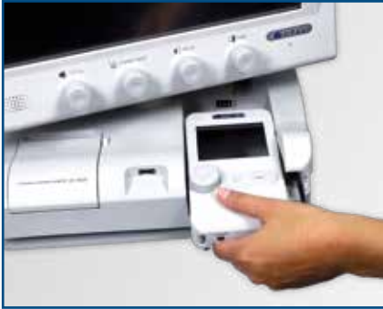
Just dock your AL-4000 to the A/B scanner UD-8000 and you have the ultimate ultrasound workstation.

This extremely handy and easy-to-use combination of Bio and Pachymeter leaves nothing to wish for in terms of comfort and flexibility. Wireless communication plus the fully integrated IOL power calculation software allow for using the complete setup of the handheld device AL-4000 on the PC.