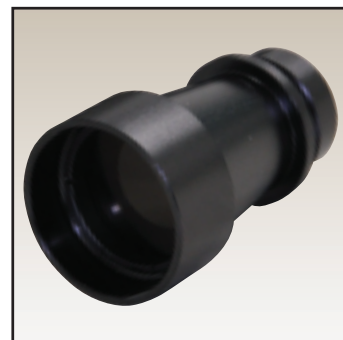
Long eye relief 3 X (option)